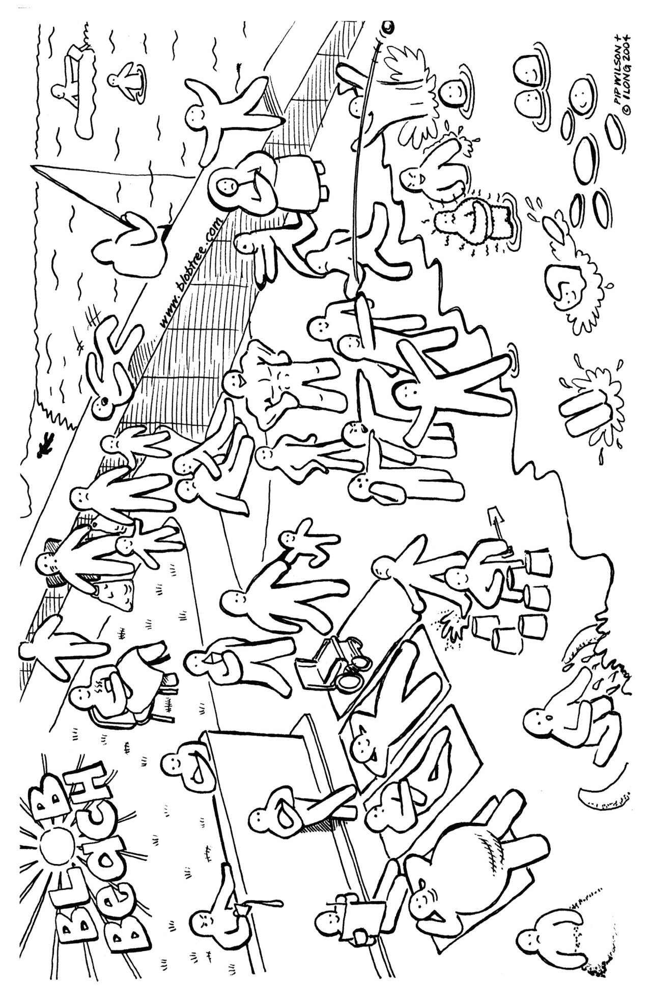
© Pip Wilson and Ian Long, 2007. Permission is granted for the user to photocopy this page for instructional use only.